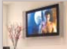
Hills Home Hub

Imagine being able to select your favorite music from one of four sources (e.g. MP3 player, computer, CD player, radio) in different locations within your home. You'll love the Hills Home Music system.