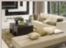
Distributed Audio System

Imagine being able to select your favorite music from one of four sources (e.g. MP3 player, computer, CD player, radio) in different locations within your home. You'll love the Hills Home Music system.