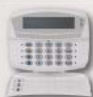
Icon Code Pad