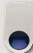
Combo Siren & Strobe