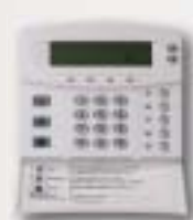
LCD Code Pad