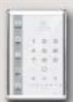
VoiceNav Code Pad