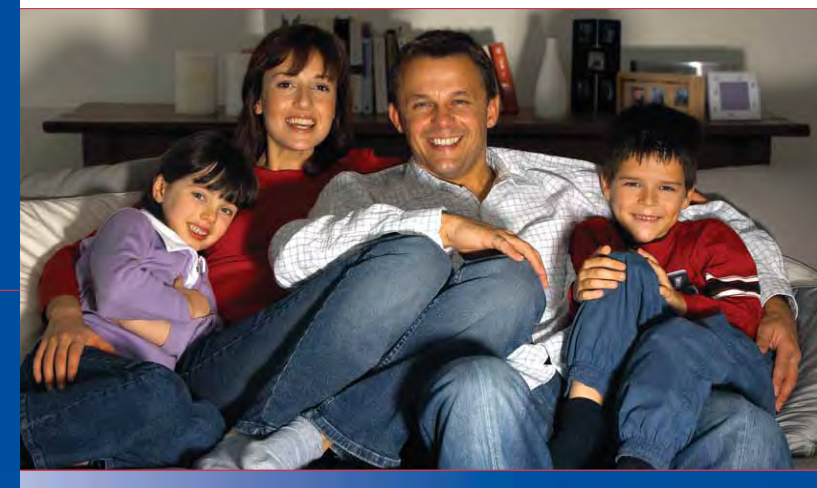
Build a home that's wired for technology